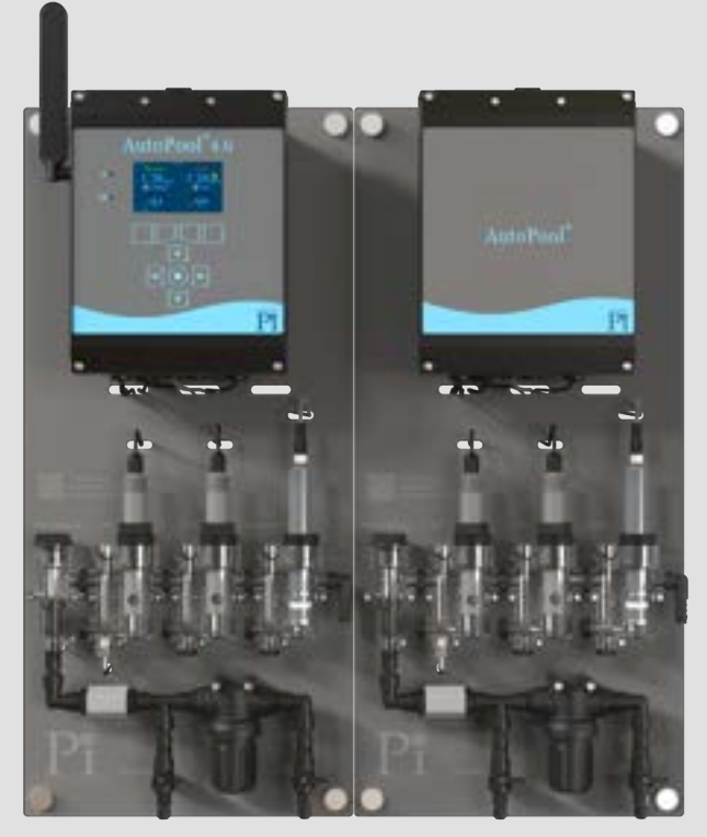
AutoPool®4.0 Duo with additional pool