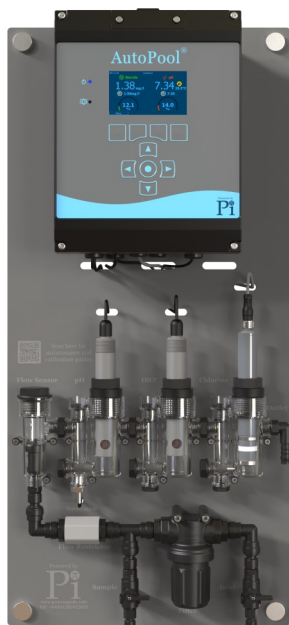
Fig.1 - An Example of a Autopool® pool controller

The times of heaviest pool usage is effectively measured by the chlorine demand in the pool. The controller provides the operator with four bands '1', '2', '3' and '4' with user settable boundaries (Fig.2).