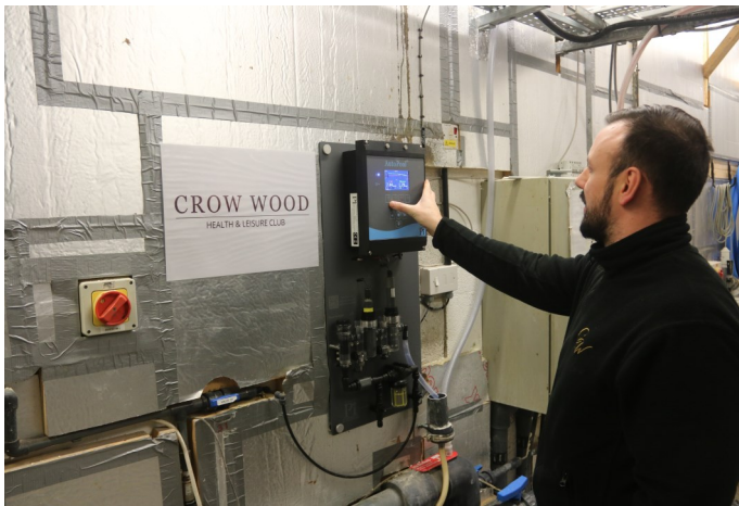
Fig.3 - A picture of one of the Autopool® pool controllers installed at Crow Wood Leisure

Crow Wood Leisure in Burnley, UK is a high quality, award winning, private leisure facility running a number of pools and spas. In a drive to increase bathing water quality and to reduce CO 2 emissions, Crow Wood installed two CRIUS® pool controllers (Fig.3) in 2008 and renewed them in 2022.